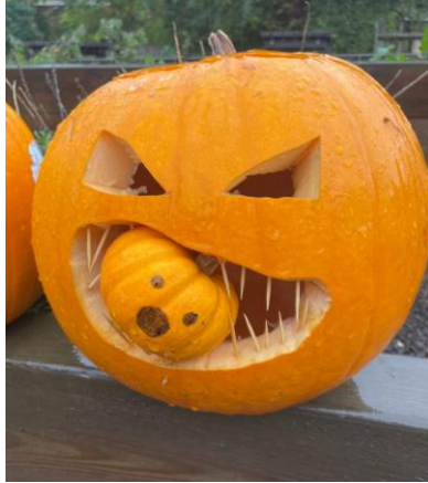
2nd: Clara (Memphis Class)