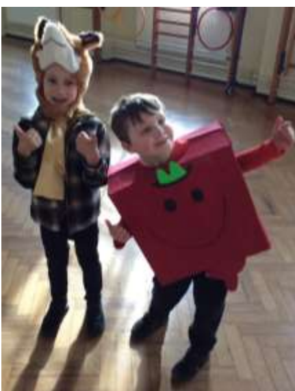
Fantastic Mr Fox and Mr Strong!